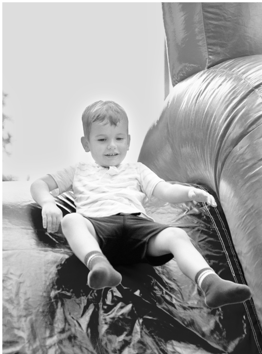
Our community had a blast at the Fall Block Party! We enjoyed food, drinks, and fun activities for all ages.