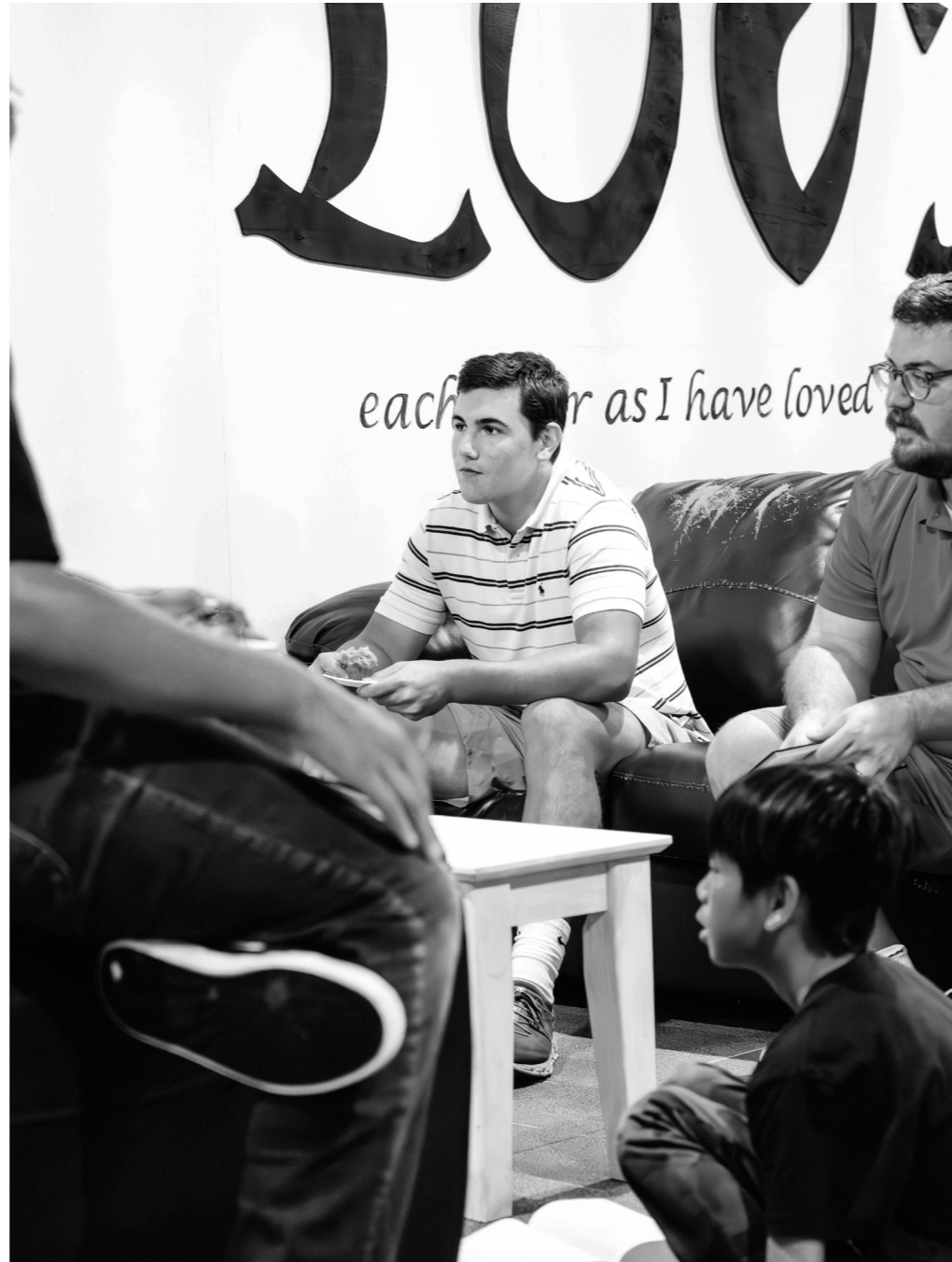
Right: At Youth our students are reminded that they matter, are beautiful, are made for love, and belong.

H eading into 2025 and beyond, we have been considering what it might look like for us to be the sort of Church where 20 or 30 years from now we are still a vibrant, flourishing, healthy community in which God regularly remakes and renews people's faith. Redemption is a church where absolutely anyone can seek to live a life with Jesus at the center. This has always been true of us and it will remain true of us. Yet, we are a unique church. God has situated us to be a community where people who are convinced there are no asterisks on God's love can seek to lead Jesus centered lives in a church where they don't feel the need to hide their identities, pasts, and theological questions or conclusions. This unique feature of Redemption has been true of us from the start and has provided a life-line and community of faith for many without one. For us to be this in 2054 will mean intentionally pursuing health, communion and worship as a community. So this year, we are focusing on our unique vocation as a church along with inviting you to explore your particular vocation as an individual member of this beautiful collective Christ has drawn together.